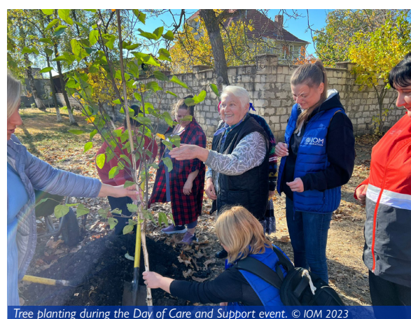
Tree planting during the Day of Care and Support event.

To promote social cohesion, IOM organised a Day of Care and Support event for refugees and people with medical conditions at the Centre for Elders and People with Disabilities. Activities included the distribution of food and NFIs, Mental Health and Psychosocial Support (MHPSS) art sessions, and planting of trees. To enhance capacity, a training session was organized for employees of the Territorial Social Assistance Directorates and National Employment Agency subdivisions. The session covered various aspects of temporary protection status granted to displaced persons from Ukraine, encompassing benefits, restrictions, employment conditions, and other regulations pertaining to the residency rights of foreign citizens within the Republic of Moldova. Moreover, quick-impact development projects were implemented to upgrade facilities used by community residents, fostering a sense of shared well-being and inclusion. These projects involved rehabilitating playgrounds in Popeasca, Otaci, and Chirsova villages.