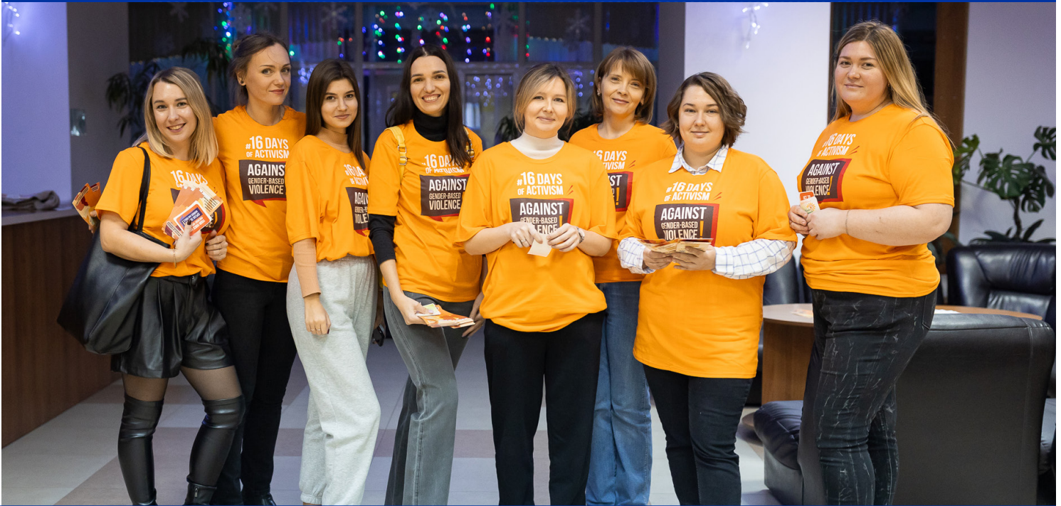
IOM's implementing partner, Women's Initiatives, at the 16 days of activism against gender-based violence campaign in the Transnistrian region.