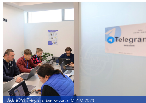
Ask IOM Telegram live session.

IOM continues to mainstream AAP through online information sessions , a toll-free call centre , and community information centres , offering comprehensive information on IOM project activities, available support and acting as a platform for receiving complaints, feedback, and referrals. In November, an information session hosted on IOM Moldova's Telegram channel , with over 1,000 members, addressed 39 questions about IOM's assistance. The toll-free call centre at 080010877 continues to serve as the primary channel for referrals, feedback, and complaints. Throughout the reporting period, a total of 1,433 calls were received, with the majority of inquiries focusing on rental assistance, cash assistance, and legal support.