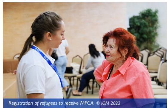
Registration of refugees to receive MPCA.

IOM provides essential Multi-Purpose Cash Assistance (MPCA) to refugees from Ukraine currently residing in the Transnistrian region, mirroring the support refugees receive on the right bank of the river to address their critical needs. To enhance communication with the affected populations and raise awareness on the available support, an information session was organised, addressing the registration process for the MPCA, roles and responsibilities, and facilitating Q&A. Additionally, the registration form for the provision of MPCA to unaccompanied children and adult dependents was finalized in coordination with the Protection unit. The registration tool assesses children's conditions to confirm the caregiver's risk level for assistance enabling them to receive cash on behalf of children.