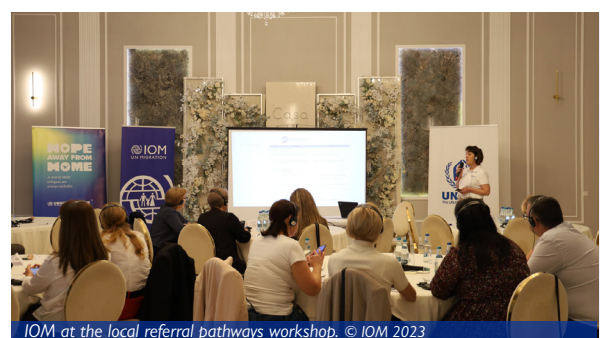
IOM at the local referral pathways workshop.

IOM is involved in developing context-specific training for enhancing the capacity of RACs in the Republic of Moldova. A module on operational procedures in RACs, including reception, registration, and orientation, was piloted in coordination with ACTED site management staff. Moreover, community-based coordination training was organized for IOM staff, and a workshop was conducted with 25 representatives of civil society organizations from the Transnistrian region to validate and formalize the local referral pathways for the Transnistrian region.