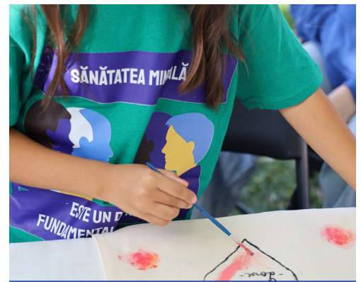
Psychosocial art during Mental Health and Wellness fair.

IOM prioritizes the well-being of the affected populations. Events were organized to enhance relational skills and leadership, including a two-day conference in the Transnistrian region on prospects for the socio-cultural integration of refugees. In October, in observance of World Mental Health Day, IOM participated in the first Mental Health and Wellness Fair in the Republic of Moldova. The IOM program featured psychosocial art, socio-recreational activities, yoga, a quiz wheel, and a puppet theatre show, aiming to raise awareness about the theme "Mental health is a universal human right." Furthermore, on the International Day of Care and Support, elders and Ukrainian refugees at the national asylum for disabled and retired persons were actively engaged in psychosocial activities , fostering a supportive exchange and cooperation within the local community. Moreover, IOM's commitment has extended to Moldovan returnees from the Gaza Strip who received Psychological First Aid (PFA) and psychological group counselling. Additionally, six training sessions, engaging 200 humanitarian workers, were organized with a focus on self-care , emotional intelligence , PFA , professional burnout , and stress management . Moreover, to support the Refugee Accommodation Centres (RACs) consolidation strategy, the MHPSS team conducted five visits to RAC to provide support and psychological counselling to the residents.