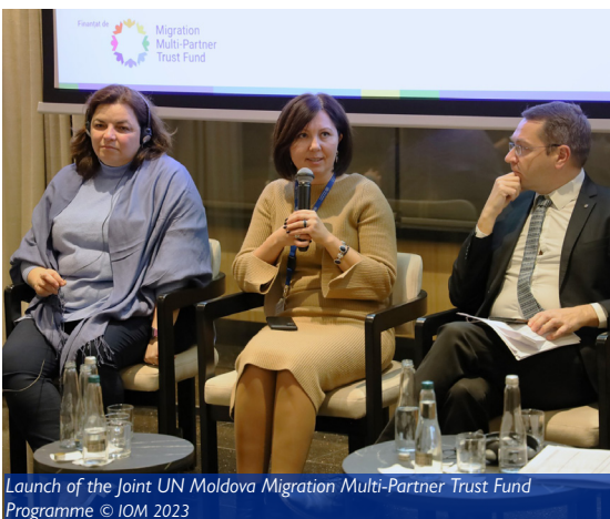
Launch of the Joint UN Moldova Migration Multi-Partner Trust Fund Programme