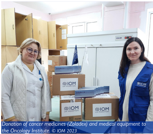
Donation of cancer medicines (Zoladex) and medical equipment to the Oncology Institute.