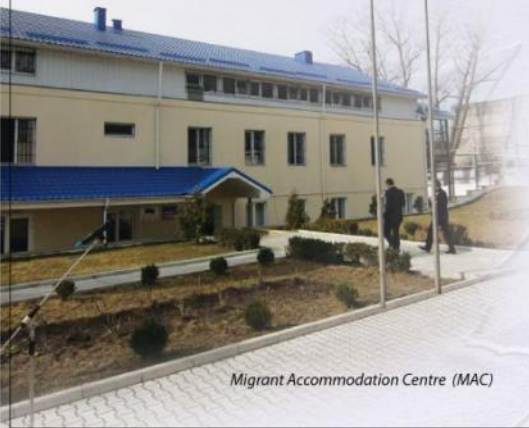
Migrant Accommodation Centre (MAC)