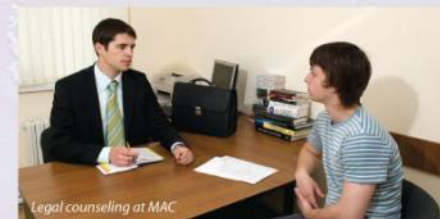
Legal counseling at MAC

The action aims at contributing to safeguarding of the rights of irregular migrants placed in the Migrant Accommodation Centre, through continuation and improvement of delivery of legal, social and medical assistance.